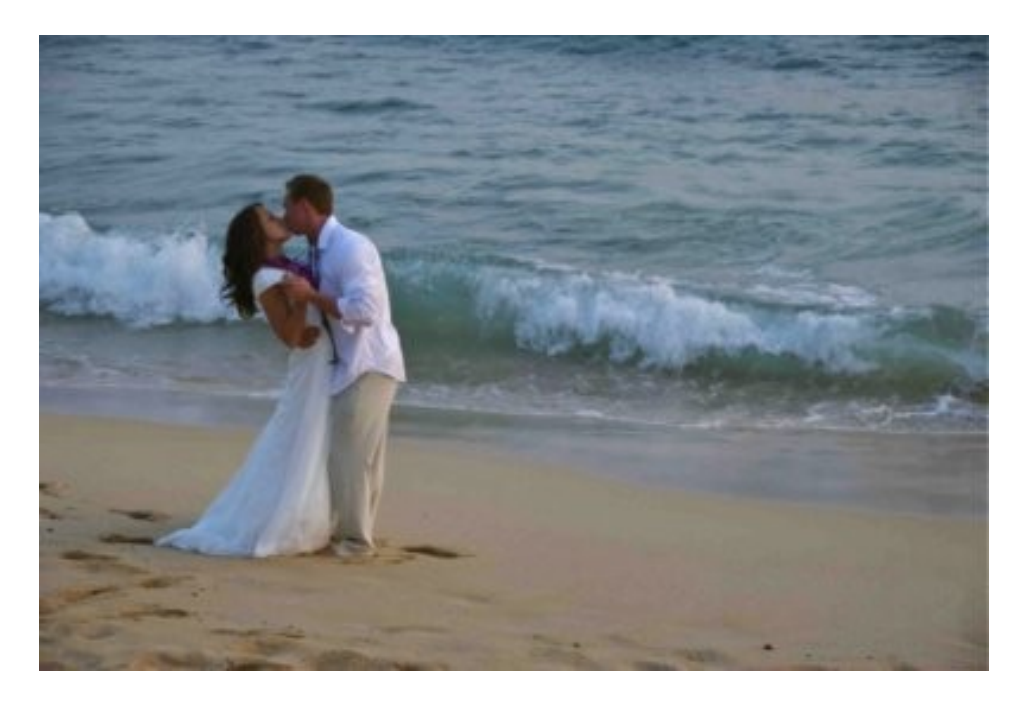
Why Choose Kauai?