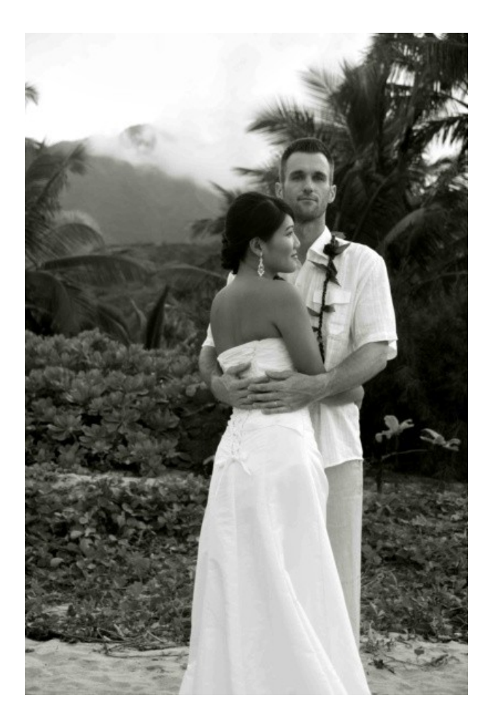
6. Getting Professional Wedding Photography is Worth the Money

Having a Kauai beach wedding will be one of the most memorable events of your life. It's not scenery you could ever reproduce later on the mainland when you have more money ... you don't want to miss having the best possible photos and editing done that you can while you're here. Having captured moments to treasure and share forever by utilizing our professional <u>Kauai photography</u> community is one of the most crucial steps in planning your big day, so don't forget to set up your photographer early to assure getting the date you want!